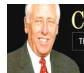
Steny Hoyer House Minority Whip