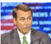
John Boehner House Majority Leader