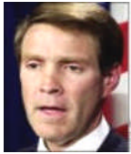
Bill Frist Senate Majority Leader