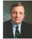
Richard Durbin Senate Minority Whip