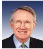
Harry Reid Senate Minority Leader